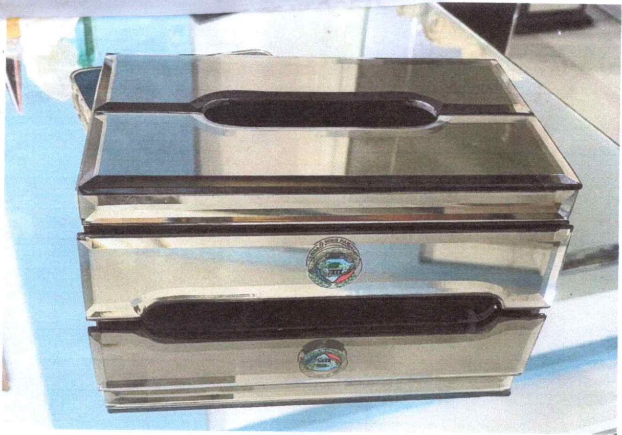
Tissue Holder made of Bronze Mirror with pampanga logo \frac{1}{4} thickness approx. 9\frac{1}{2} " W x 6" D x 3\frac{1}{2} " H