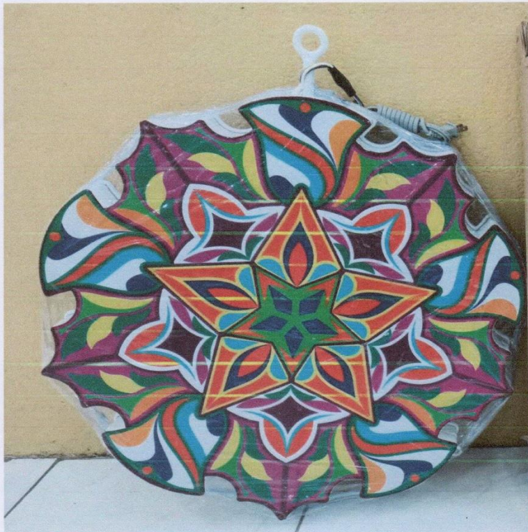
Christmas Lantern Made of molded Plastic Structure