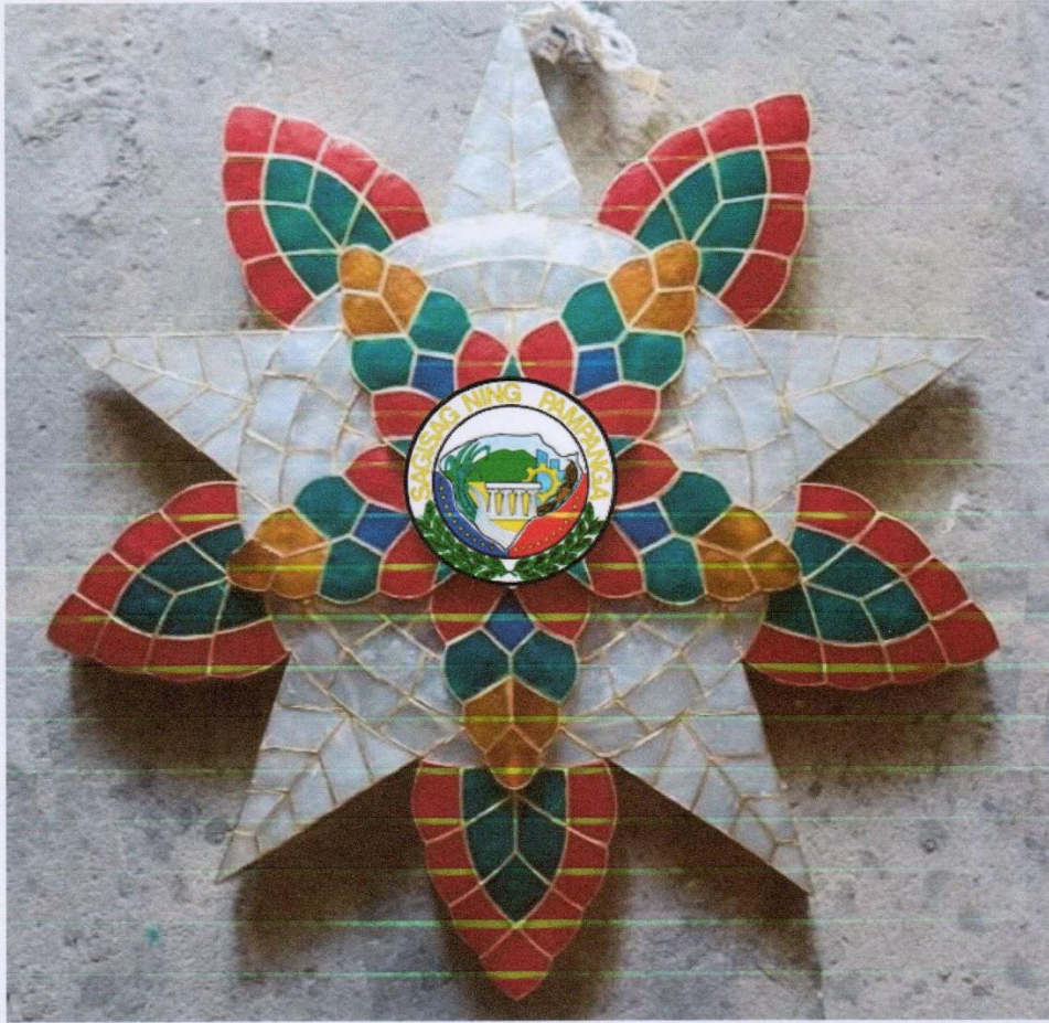
Capiz Lantern Size: 36"