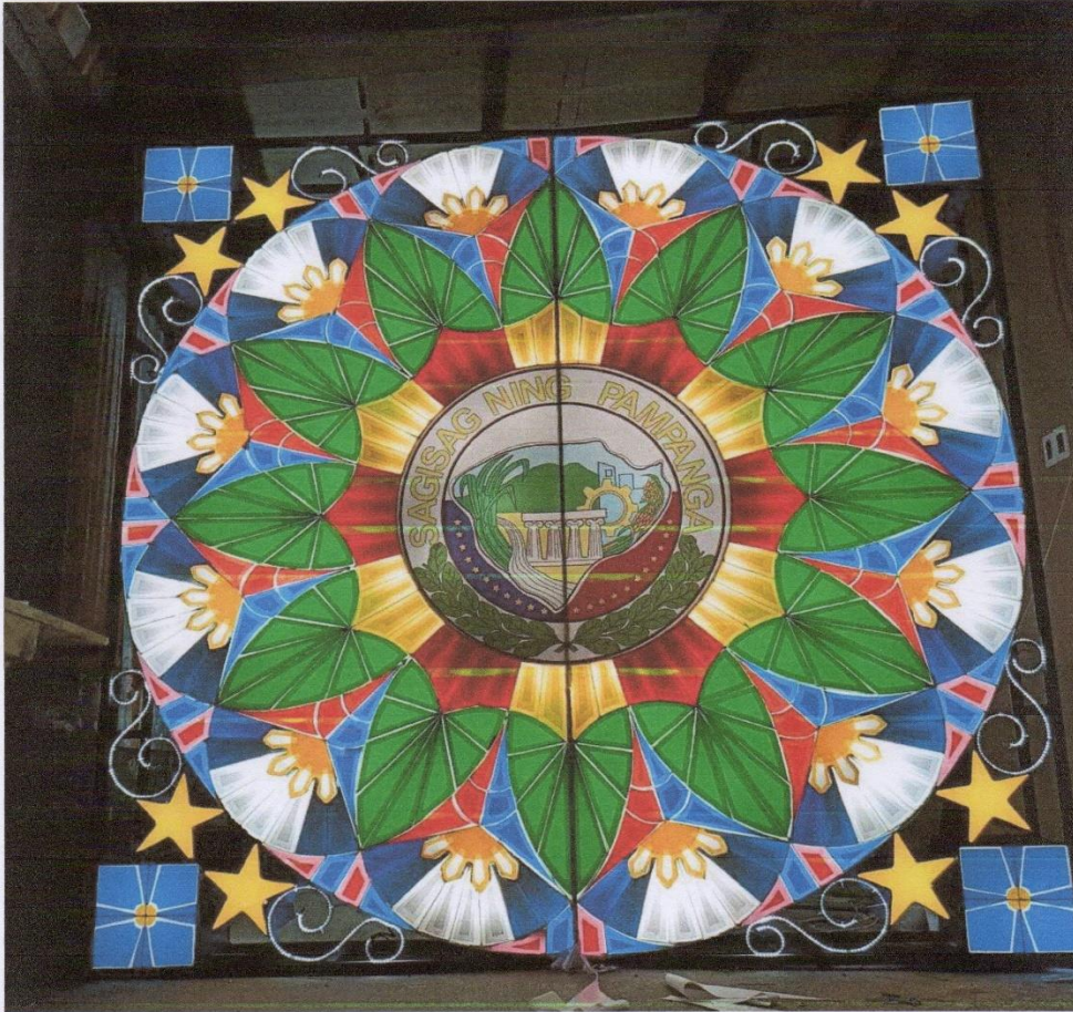
Folded Computerized Pampanga Giant Lantern Size: 8 ft