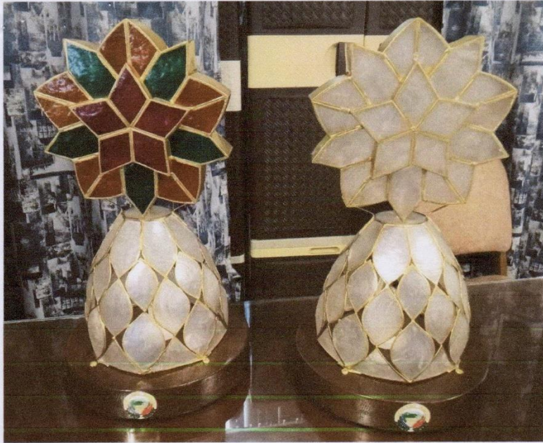
Table Lamp Made of Capiz shell with wood stand with Pampanga Logo