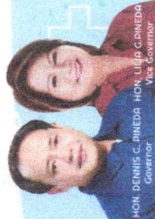
HON. DENNIS C. PINEDA Governor