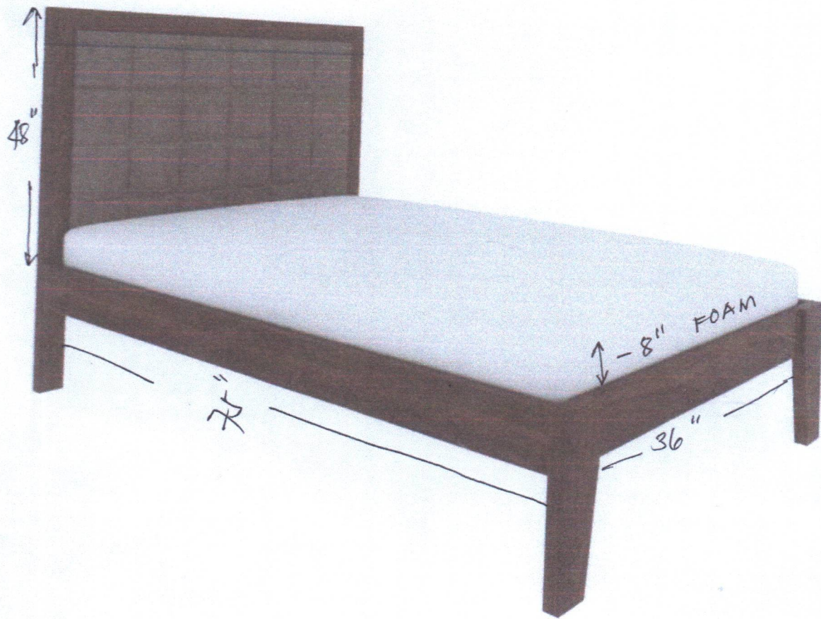
SINGLE SIZE BED