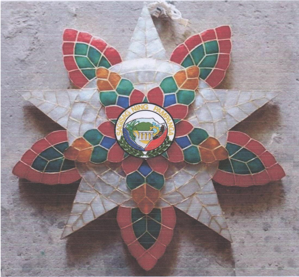
36 " Capiz Christmas Lantern with Pampanga Logo