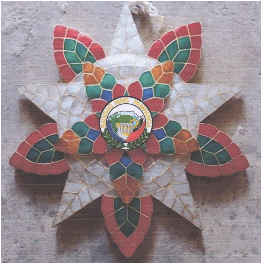
36 " Capiz Christmas Lantern with Pampanga Logo