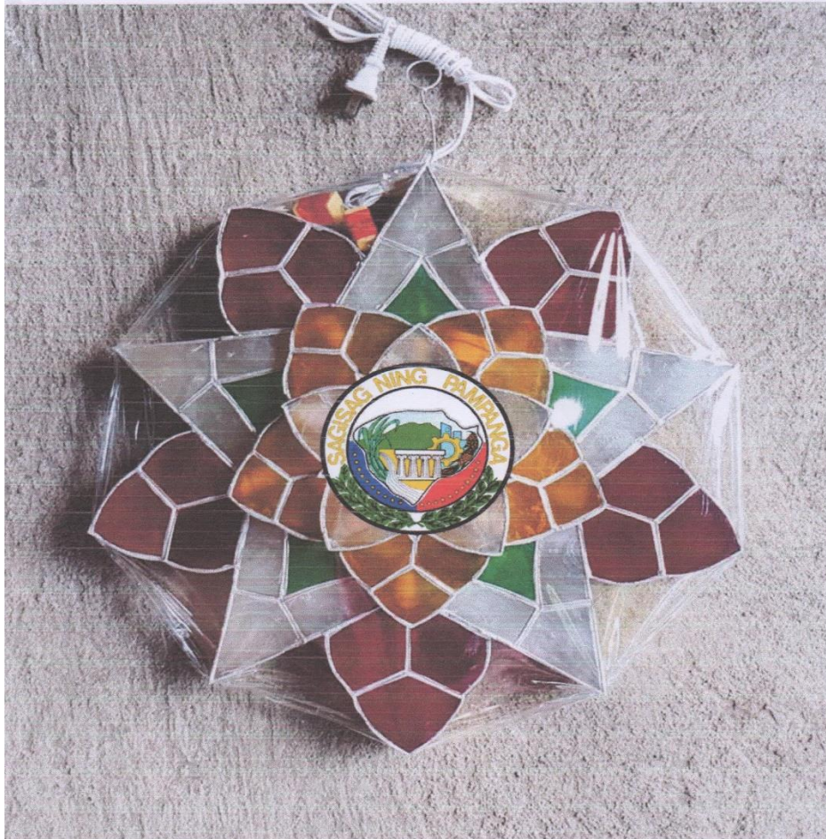
16 " Capiz Christmas Lantern with Pampanga Logo