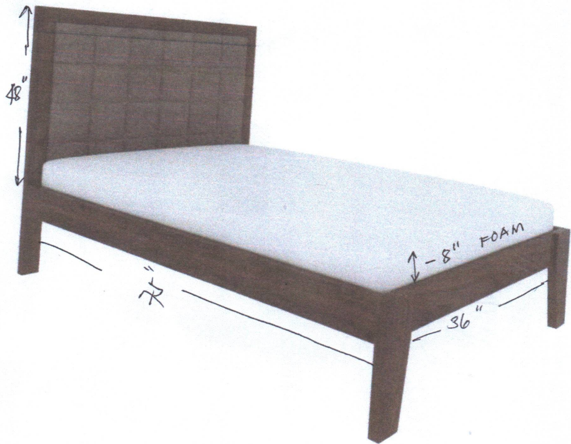
SINGLE SIZE BED